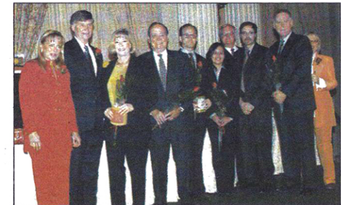
Presenters and Standing Ovations award recipients from the Walt Disney Concert Hall, Museum of Contemporary Art and Staples Center.